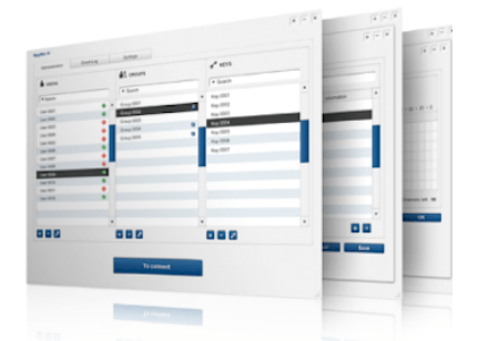
9500 SC Series is powered by KeyWin 6 Pro Standard Software at No Extra Charge

The 9500 SC Series key cabinets offer a choice between a capacity of 14 to 98 key slots and includes durable solid metal intelligent locking key fobs. The 9500 SC Series can be easily upgraded by adding expansion key strip modules with 14 keys each, and will increase the number of keys managed by a single system to 588. An unlimited number of keys can be managed by networking. A complete range of options and accessories are available for the 9500 SC Series