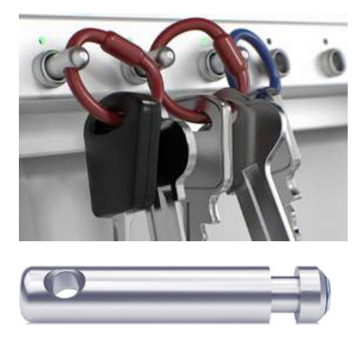
Secure-Lock Exclusive 100% solid metal intelligent locking key fobs

Choosing the right key system for your key management requirement is an important task to ensuring that you are choosing a key system that will secure your valuable keys 24/7 Key-Box is an easy intelligent choice as it's the only key system in the market place that offers its exclusive Secure-Lock high security 100% solid metal intelligent locking key fobs. Each key fob is individually locked in place inside the cabinet to ensure keys are not removed by unauthorized users