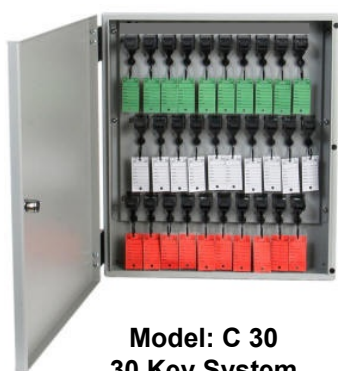
Model: C 30 30 Key System