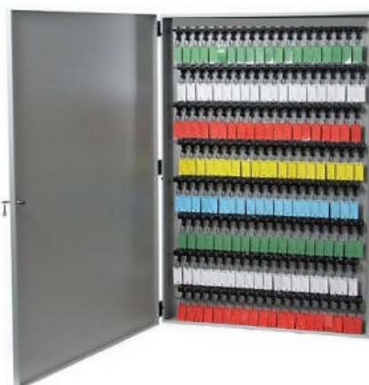
Model: C 160 160 Key System

Our Secure-Lock alternative mechanical key management systems are suitable for managing keys in all sorts of facilities such as housing complexes, condo facilities, hotels/resorts, commercial properties, law enforcement facilities, fleet management, automotive car dealerships, warehousing, airport facilities, etc.