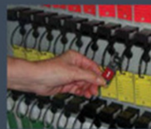
Insert the key