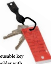
Reusable key holder with tamper Proof key ring