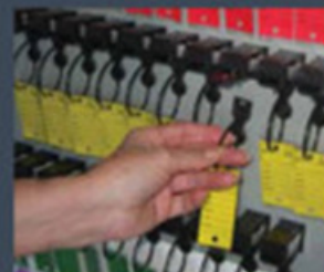
To Release the keys