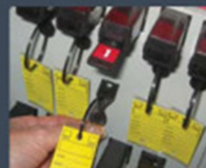
Returning the keys releases the access key