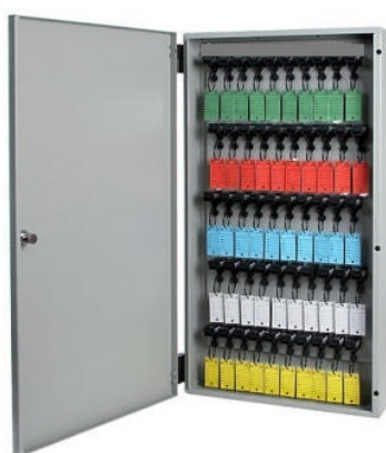
Model: C 50 50 Key System