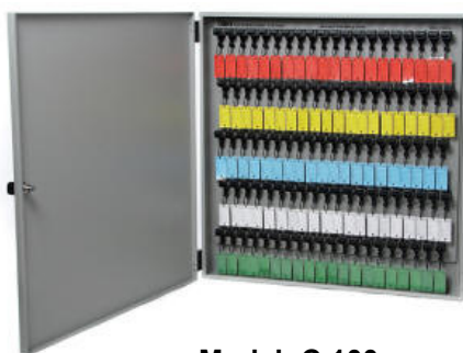
Model: C 100 100 Key System