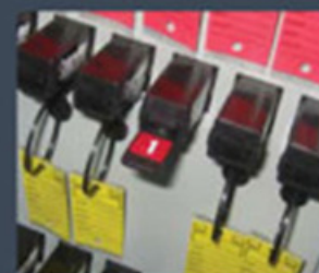
Access key remains while the keys are checked out