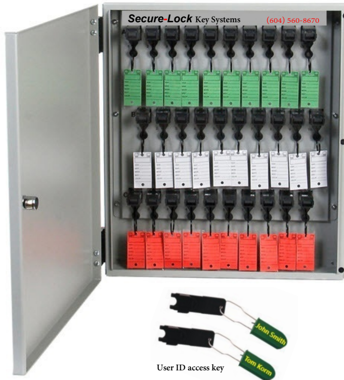
User ID access key