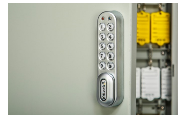
New Optional PIN access

The way our Secure-Lock key systems work is an authorized user with their assigned access ID key enters their ID key into the key lock holder with the facility key/keys they require once the user ID key is entered into the key lock holder the facility keys are released. When the user returns the keys they would insert the key holder with the at-tached keys back to the key lock holder, the key lock holder would than release the users ID key.