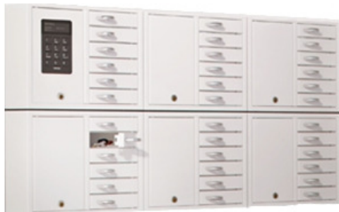
9006 E Expansion cabinet with six compartments