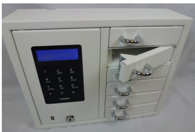
9006 S Series

For Storing/Securing all Businesses/Organizations Facility/Asset Keys