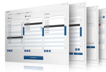
KeyWin 5 Pro Software

Key-Box Key Management Systems are the affordable intelligent choice!