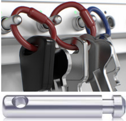
Secure-Lock Exclusive 100% solid metal intelligent key fobs

Choosing the right key system for your key management requirement is an important task to ensuring that you are choosing a key system that will secure your valuable keys 24/7 Key-Box is an easy intelligent choice as it's the only key system in the market place that offers its exclusive Secure-Lock high security 100% solid metal intelligent locking key fobs. Each key fob is individually locked in place inside the cabinet to ensure keys are not removed by authorized users