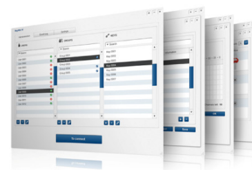
KeyWin 5 Pro Software

Key-Box Key Management Systems are the affordable intelligent choice!