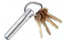
Non-Locking Key Fob