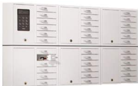
9006 E Expansion cabinet with six compartments

$2,195.00 for each 6 compartment expansion cabinet