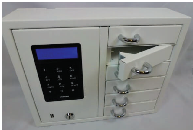
9006 S Series

For Storing/Securing all Businesses/Organizations Facility/Asset Keys