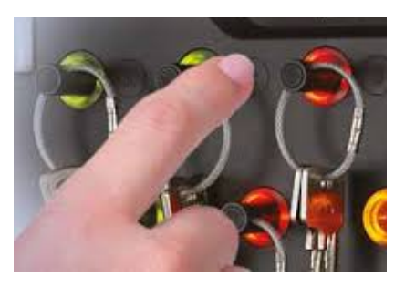
All individual keys and key sets are locked by the traka 21 key system