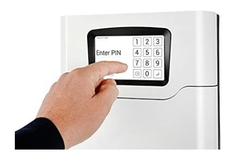
User is required to enter their unique access PIN code to gain access to the key cabinet